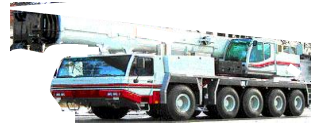
Under Own Power

Units Two, Three, Four, Five & Six: Enter the license number; state it is licensed in, complete vehicle identification number, year and make. Check one box for unit type. Examples follow: