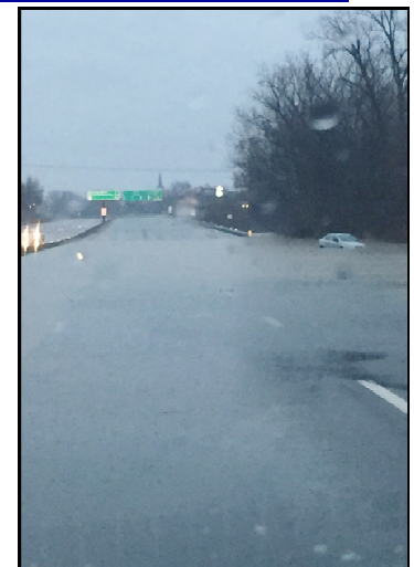
Flooding on I-70 last month

According to the National Weather Service, the storm made 2015 the wettest year on record. December 26 also broke some records with the nearly five inches of rain that fell that day making it third wettest day ever recorded in St. Louis history.