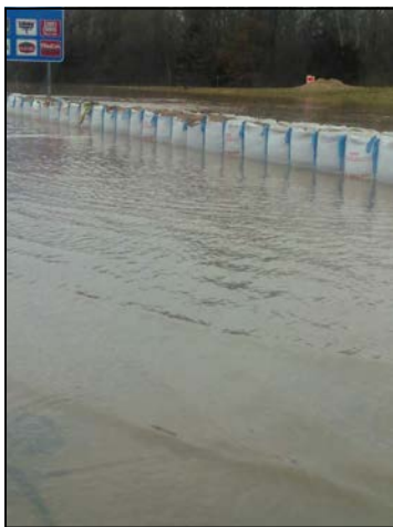
Flooding on Interstate 55

The rain also caused the side of Route T in Franklin County to slide away. We are working on getting bids on the repairs and hope to have Route T back open to traffic sometime in March if the weather cooperates.