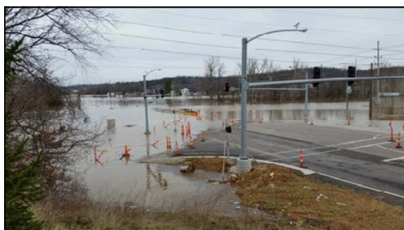
Flooding at Route 47 North and Route 50