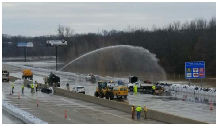
Crews pumping water off Interstate 55