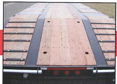
Wood Filled Bucket Trough