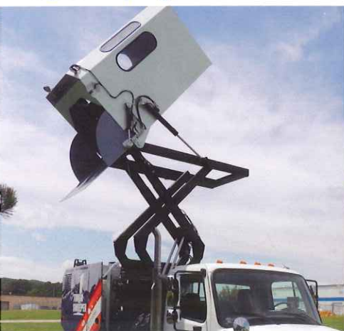
49" Diameter Side Broom(s) with Gutter Broom Extension Override.

Easy to use backlit switches with text and icon labels.