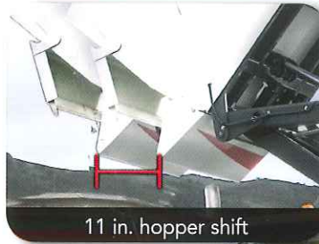
11 in. hopper shift

The Eagle features a variable-height, right side dump hopper with a capacity of 4.5 cubic yard (3.4 cu meters) volumetric. All hopper lift and dump controls are hydraulic and easily operated from in-cab console mounted controls. A 50 degree dump angle allows material to easily slide out.