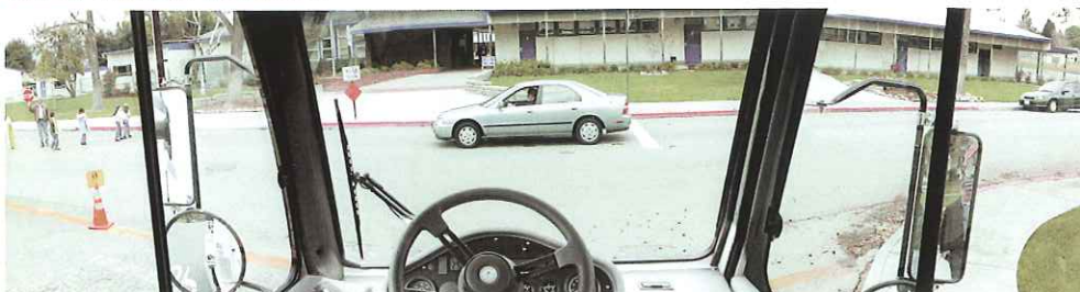
ABOVE Exceptional visibility increases operator and pedestrian safety.