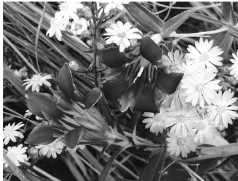
FHWA Photo Opportunity 1st Place

MoDOT took first place in two categories in the Federal Highway Administration Annual Photo Opportunity contest. The contest recognizes organizations for their use of quality photos to increase awareness of roadside issues. This is the fourth consecutive year Missouri has placed first in at least one category.