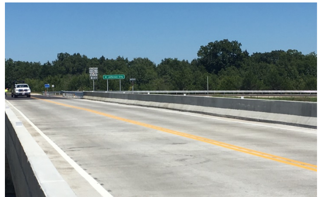
Completed concrete pavement

“The use of FRC can provide cost savings for both user and social costs for the low and high traffic volume scenarios.”