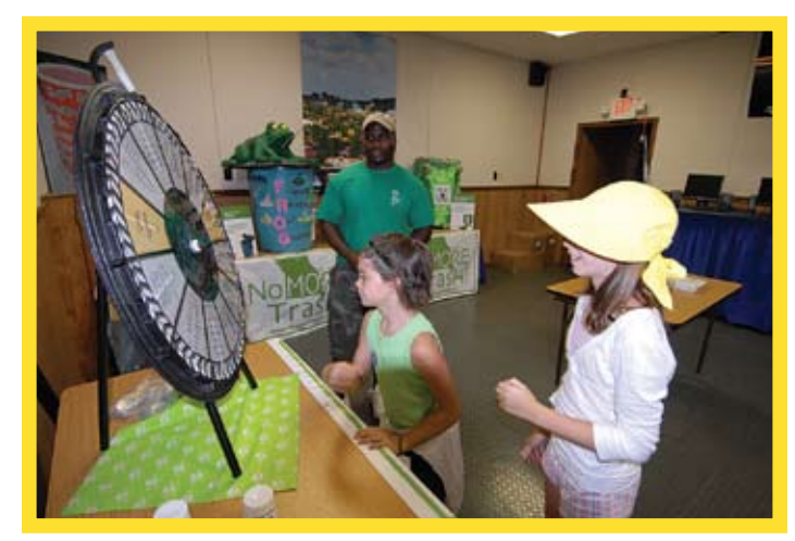
Inside the air-conditioned Exposition Center kids can enjoy a bunch of games that teach them about the importance of a clean environment. Parents can obtain information about sponsoring or adopting a local state highway for litter clean up.