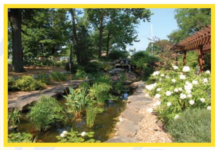
The beautiful gardens that surround the Exposition Center will be in full bloom this August. The gorgeous waterfalls and ponds are home to a number of goldfish. This is a place where families can come to unwind, relax and enjoy the scenery.