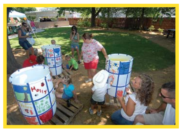
Last year at the State Fair, kids were given the opportunity to express their creativity by decorating No MOre Trash! trash cans. After they were complete, the cans were displayed outside of the Highway Gardens Transportation Exposition Center for all to admire.