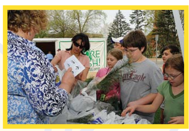
Everyone who attended the Earth Day celebration could get a white pine seedling to plant in his or her yard. MoDOT gave away over 3,000 seedlings throughout the day.