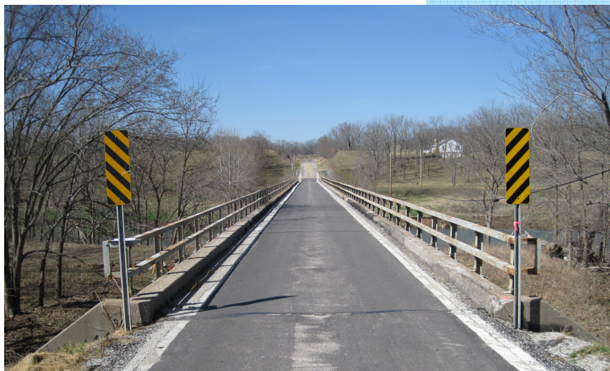
Current Single Lane Bridge

To complete the bridge replacement over the Gasconade River, it will be necessary to close the bridge. The closure will last approximately 60-75 days and will occur June-July of 2012. A detour will be signed during this time ( see back ).