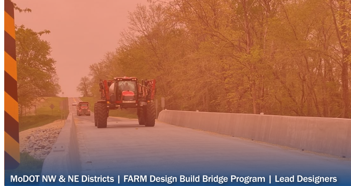
MoDOT NW & NE Districts | FARM Design Build Bridge Program | Lead Designers