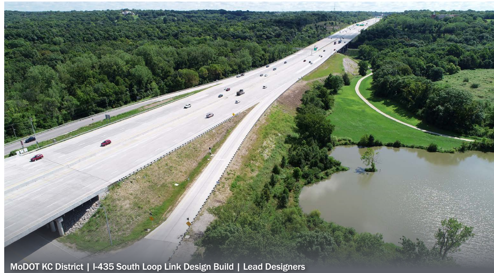
MoDOT KC District | I-435 South Loop Link Design Build | Lead Designers