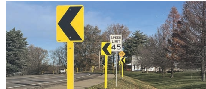
Chevrons and Curve Warning Signs

Increase visibility of stop sign by incorporating LED lights