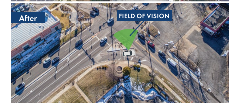
Modified Right Turns

Right turn lanes at intersections will be adjusted by modifying the island's corner and straightening the curve using white pavement marking on the shoulder to improve visibility and discourage high-speed turns.