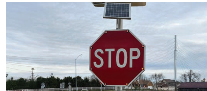
Stop Sign with Flashing LEDs

Increase visibility of signals by adding retroreflective yellow border