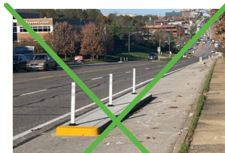
Curb Bump Out Island

The traffic calming devices proposed for New Halls Ferry are median islands and hardened centerlines at intersections.