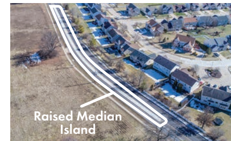
Raised Median Island

Islands along the shoulder to provide a visual prompt of a narrower roadway.