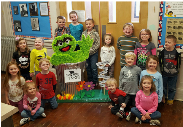
The 2017 Grand Prize winner for the statewide trash can contest was "Oscar will be your fan, if you keep it in the can!" from Cowgill Elementary in Cowgill, Mo.