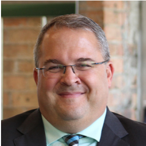
Point of Contact

Our roadway designers have worked on projects including miles of mainline pavement reconstruction or overlays, horizontal and vertical alignment modifications, new curbs, pavement drainage and all types of intersections including typical layouts, roundabouts and alternative intersection designs. TERRA's experts can help your organization determine the right design to meet the needs of any location in need of improvements.