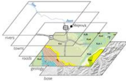
A GIS map consists of multiple layers of geographic data.