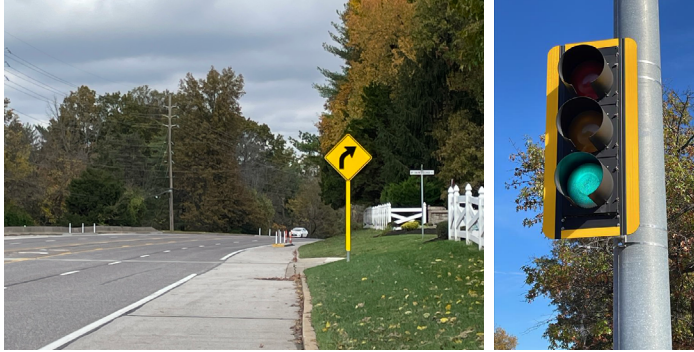
Curve Warning Sign

These improvements combined are estimated to reduce crashes on this segment of Clarkson Road by 97 crashes over five years .