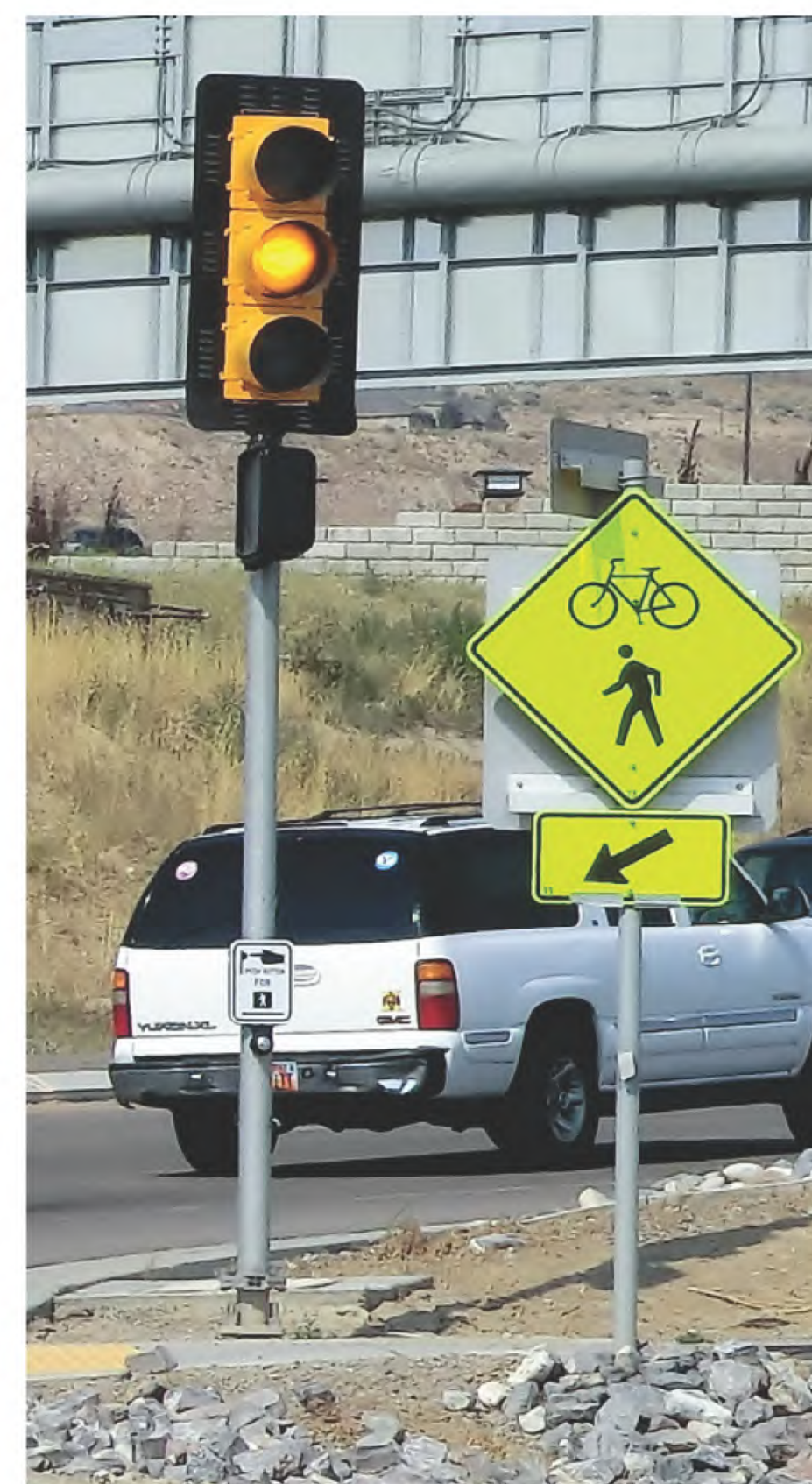
Appropriately timed yellow change intervals can reduce red-light running and improve overall intersection safety.

Transportation agencies can improve signalized intersection safety and reduce red-light running by reviewing and updating their traffic signal timing policies and procedures concerning the yellow change interval. Agencies should institute regular evaluation and adjustment protocols for existing traffic signal timing. Refer to the Manual on Uniform Traffic Control Devices for basic requirements and further recommendations about yellow change interval timing. As part of strategic signal system modernization and updates, incorporating automated traffic signal performance measures (ATSPMs) is a proven approach to improve on traditional retiming processes. ATSPMs provide continuous performance monitoring capability and the ability to modify timing based on actual performance, without requiring expensive modeling or data collection. 1