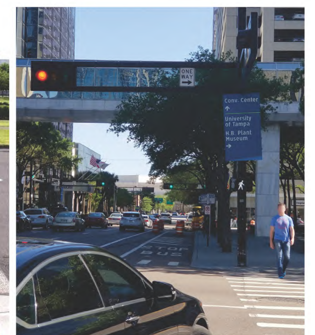
LPIs reduce potential conflicts between pedestrians and turning vehicles.

For more information on this and other FHWA Proven Safety Countermeasures, please visit https://safety.fhwa.dot.gov/provencountermeasures/ and https://safety.fhwa.dot.gov/ped_bike/step/resources/docs/fhwasa19040.pdf .