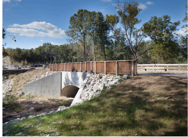
Box Culvert at the Community Park in Wildwood - A floodplain analysis of Bonhomme Creek was performed to determine the opening and length of a 3-sided precast concrete box culvert. The culvert is under the main roadway, which connects users to passive and active sections of the park.