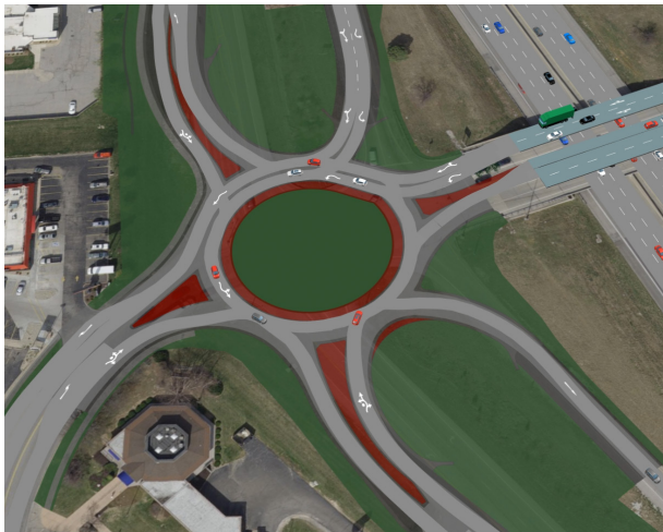
Lake Saint Louis Boulevard / I-70 Roundabout in Lake Saint Louis - Screenshot of a traffic simulation video Oates prepared to help citizens visualize traffic flow. This MoDOT LPA project converts the interchange to a 6-legged roundabout.