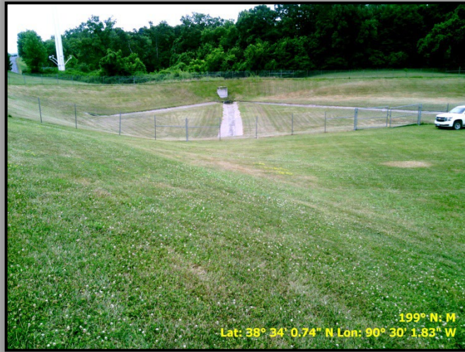
Figure 1: Permanent detention basin on Route 141 and Big Bend Rd.

The intent of this MCM is to develop, implement and enforce a program to reduce pollutants and reduce water quality impacts from site improvements on MoDOT's system.