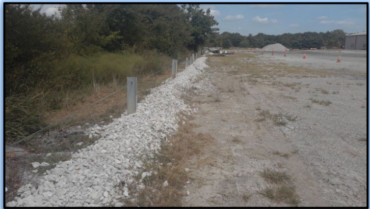
Figure 3: Maintenance facility in SW District.

The FRCP is kept on MoDOT's SharePoint site and at the facility location along with the SPCC plan.