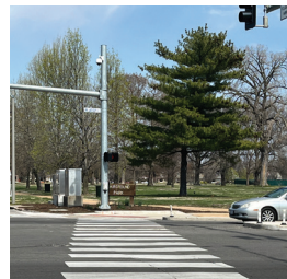
High Visibility Crosswalk

At signalized intersections, Leading Pedestrian Intervals provide pedestrians with a head start before vehicles receive a green light. This head start helps drivers notice pedestrians using the crosswalk and reduces the risk of conflicts between pedestrians and vehicles.