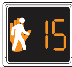
Pedestrian Countdown Timer

Sidewalks will be installed where currently none exist and existing curb ramps will be upgraded to be ADA compliant.