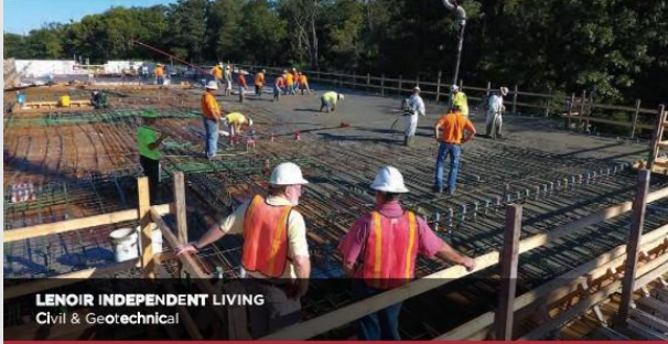
LENOIR INDEPENDENT LIVING Civil & Geotechnical