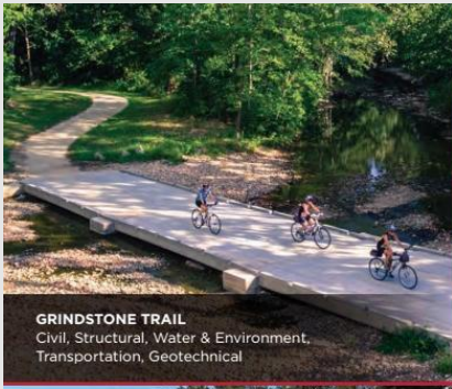
GRINDSTONE TRAIL Civil, Structural, Water & Environment, Transportation, Geotechnical