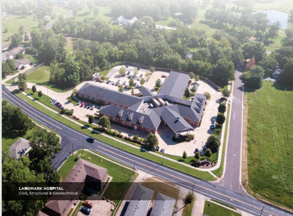
LANDMARK HOSPITAL Civil, Structural & Geotechnical

Allstate Consultants LLC (Allstate) is a full-service civil engineering consulting firm offering design solutions for public and private sector clients across the region. Headquartered in Columbia, Missouri, with offices in Marceline, MO, and Lee's Summit, MO, Allstate partners with clients to assist with all stages of project development, from funding acquisition to planning and design to construction inspection and post project support. Since 1975, Allstate's innovative, solution-based approach has been applied to a full range of projects.