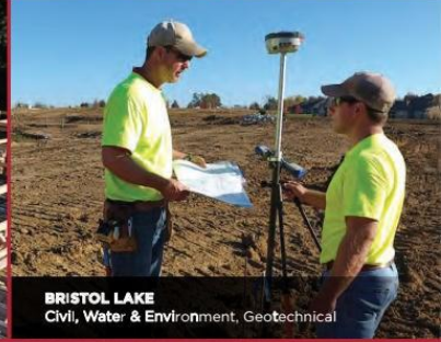
BRISTOL LAKE Civil, Water & Environment, Geotechnical