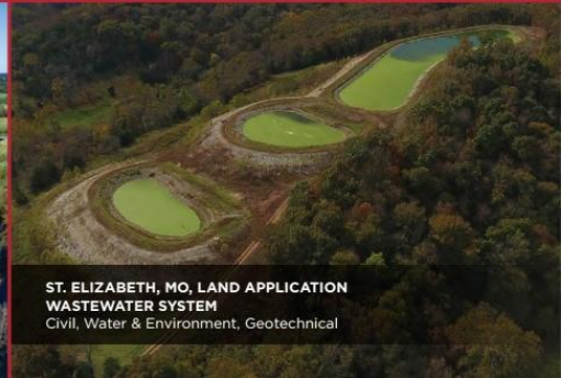
ST. ELIZABETH, MO, LAND APPLICATION WASTEWATER SYSTEM Civil, Water & Environment, Geotechnical