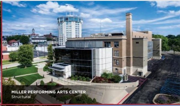
MILLER PERFORMING ARTS CENTER Structural