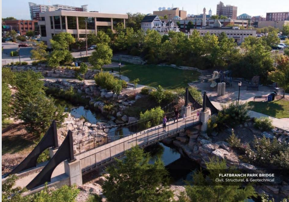
FLATBRANCH PARK BRIDGE Civil, Structural, & Geotechnical

Allstate Consultants LLC (Allstate) is a full-service civil engineering consulting firm offering design solutions for public and private sector clients across the region. Headquartered in Columbia, Missouri, with offices in Marceline, MO, and Lee's Summit, MO, Allstate partners with clients to assist with all stages of project development, from funding acquisition to planning and design to construction inspection and post project support. Since 1975, Allstate's innovative, solution-based approach has been applied to a full range of projects.