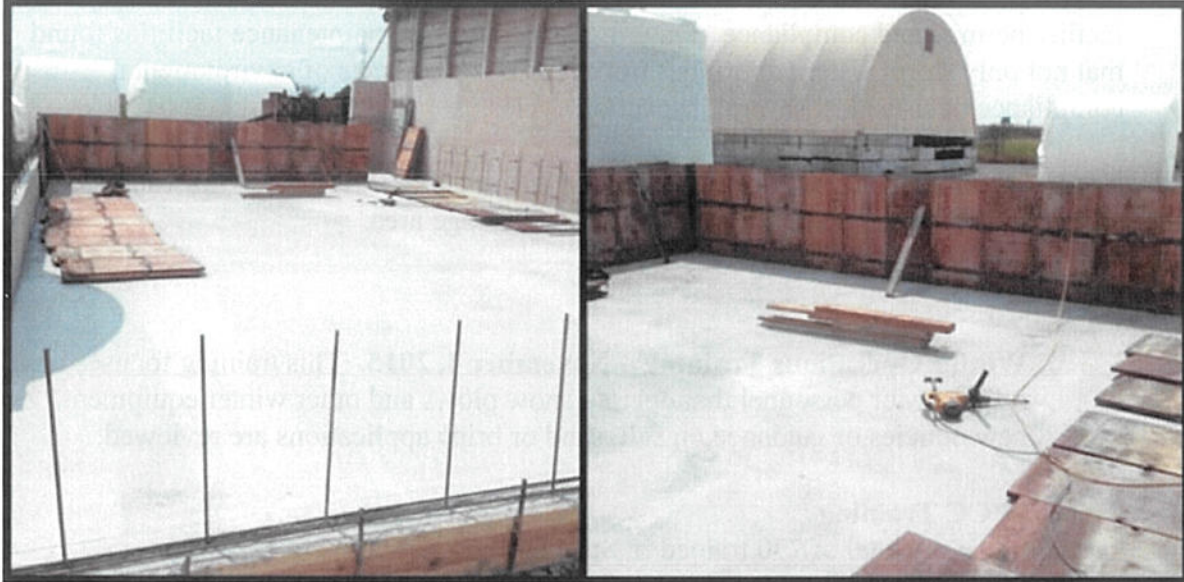
Figure 9: New brine containment facility, 9/10/15.

A new brine containment facility is being built at Williamsburg that will allow us to store up to 30,000 gallons of salt brine geo-melt at this facility. This will help minimize our salt usage, as well as help get roads back to a near-normal status quicker. It should also help minimize the amount of time plows need to be on the pavement.