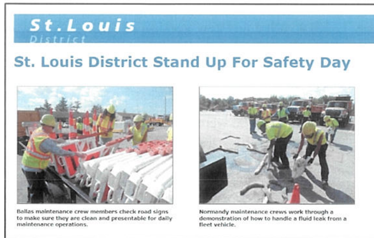
Figure 8: MoDOT spill drill October 2015.