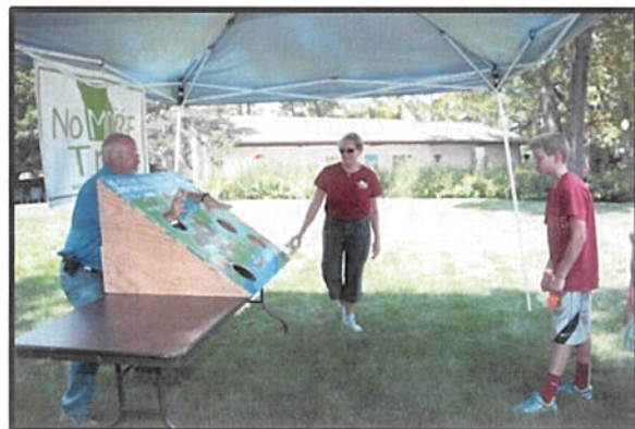
Figure 4: State Fair, 2015. Bean Bag Toss