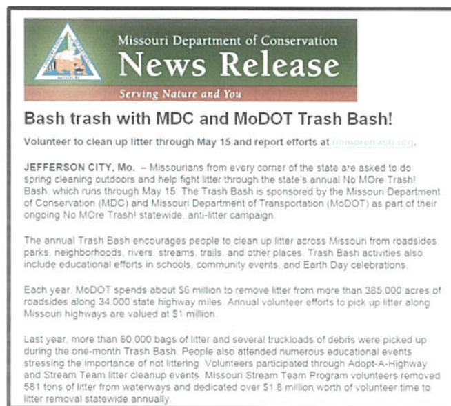
Figure 1: Trash Bash email, 4/21/16.