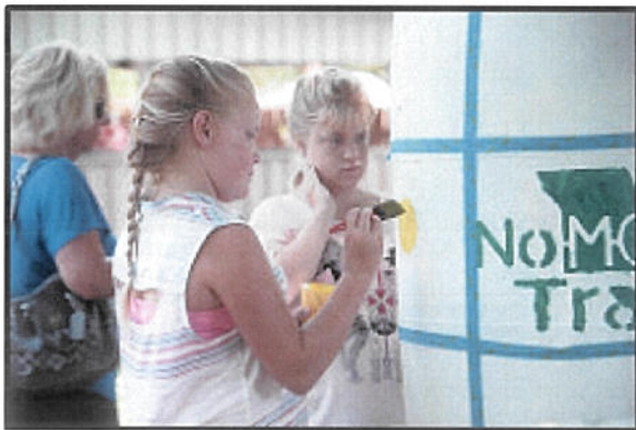
Figure 3: State Fair, 2015. Painting trash barrels.