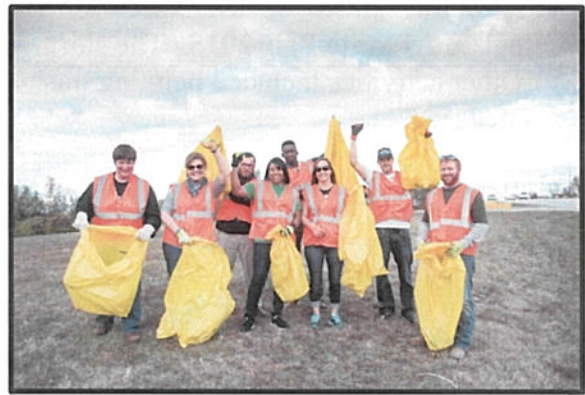
Figure 5: MoDOT employees pick up trash.