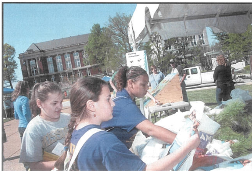
Figure 6: Seedling giveaway at 2016 Earth Day.