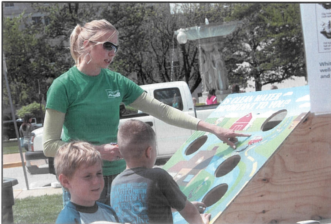
Figure 7: MoDOT Stormwater bean bag game at Earth Day 2016.