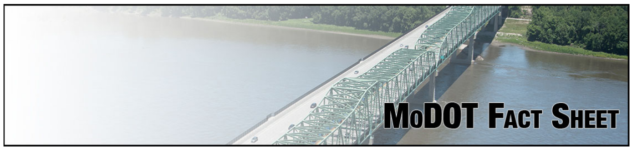
Interstate 64 Westbound Boone Bridge over the Missouri River rehabilitation project