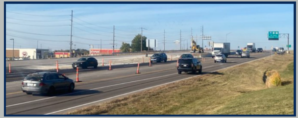
Route 63 traffic in temporary configuration for bridge construction.

These new bridges will create an underpass allowing traffic from Conley Road to move north directly into the I-70/U.S. Route 63 interchange. Building the two bridges is expected to take around 10 months. Construction crews are building the southbound bridge first, with all traffic on the northbound lanes. Once that bridge is complete, traffic will be switched to the new southbound bridge while the northbound bridge is constructed.