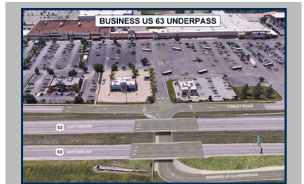
Traffic shift needed to build this future Business Route 63 underpass.

All Route 63 traffic between the Broadway overpass and the Conley Road underpass is currently pushed on to the northbound Route 63 lanes. Both directions of Route 63 briefly narrow to one lane when entering the section where traffic is pushed to one side, then it reopens to two lanes each direction.