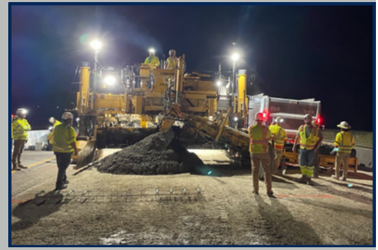
Crews conducted the first concrete pour of Improve I-70: Columbia to Kingdom City on October 21, 2024 just west of Callaway County Route M. See more photos of construction progress at https://flic.kr/s/aHBqjBBZry .