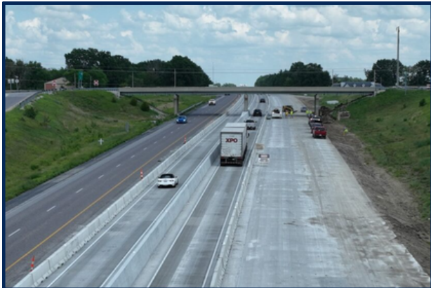
Photo shows former eastbound I-70 configuration prior to recent traffic switch. Motorists are now driving on brand new eastbound pavement.