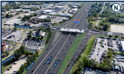
Proposed design of I-70 and Providence Rd. intersection.

Construction is anticipated to begin in Spring/Summer 2026 and be completed in late 2029. Scan the QR code for more.