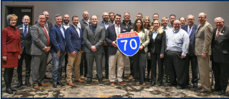
Improve I-70: Rocheport to Columbia was awarded to The ESS Team at the December MHTC meeting.

At its December meeting, the Missouri Highways and Transportation Commission (MHTC) selected The ESS Team (comprised of contractor Emery Sapp & Sons and designer Parsons) as the best-value proposer and contractor for the fourth Improve I-70 project, Rocheport to Columbia. Negotiations to finalize the contract are currently in progress.