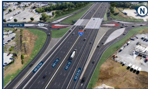
Proposed design of I-70 and Rangeline St. intersection.