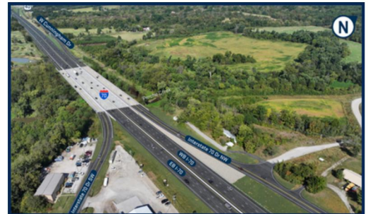
Proposed North and South I-70 Outer Rd. connections at Perche Creek.

Learn more at www.modot.org/projects/improvei70/rocheportcolumbia