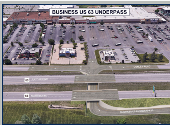
Graphic shows future Business Route 63 underpass.

Construction at the I-70 and U.S. Route 63 interchange is scheduled to begin in early October as part of Improve I-70: Columbia to Kingdom City . Crews will be working on Route 63 between I-70 and Broadway to build two new bridges to enhance the local connectivity in the area. Exact dates and times of this work will be announced soon.