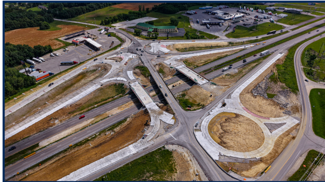
Construction progress at I-70 and Route T/W in Foristell.

As part of the Warrenton to Wentzville project, interchange improvements are underway for the I-70 and Route T/W interchange in Foristell (Exit 203). Crews are currently in Phase 3 (of six total phases) of their construction schedule and are anticipated to enter Phase 4 in July. During Phase 3, crews have been constructing the new westbound I-70 on ramp.