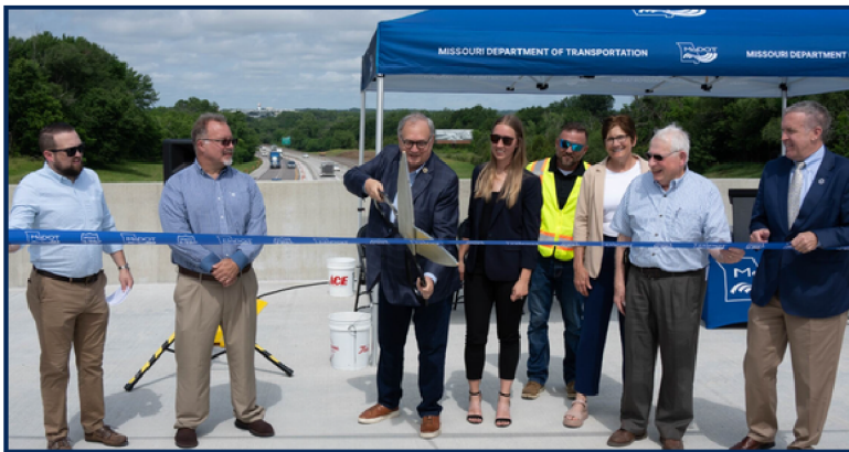
Members of the Missouri Highways and Transportation Commission, the Improve I-70 team, and elected officials cut the ribbon the new Lefholz Road bridge over I-70.

The Improve I-70: Blue Springs to Odessa project team hosted a milestone event in early June commemorating the on-time completion of the Lefholz Road Bridge over I-70 near Grain Valley (approximately mile marker 26). Joined by numerous local leaders and elected officials, the ceremonial ribbon was cut on a brand new bridge. The original bridge was demolished and replaced in under four months.