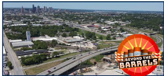
Improve I-70 KC is underway but work has paused downtown for the World Cup.

This summer, Kansas City will host six matches as part of the 2026 FIFA World Cup. This event comes during one of the state's busiest construction seasons to date with five active Improve I-70 projects between Blue Springs and Wentzville. In addition to MoDOT's $2.8 billion Improve I-70 Program, MoDOT's Kansas City District is delivering a $237 million Design-Build project that will improve a portion of I-70 in downtown Kansas City between The Paseo Boulevard and U.S. 40/31st Street. MoDOT Kansas City has worked hard to ensure that Kansas City is ready for an increase in traffic volumes during this historic event.