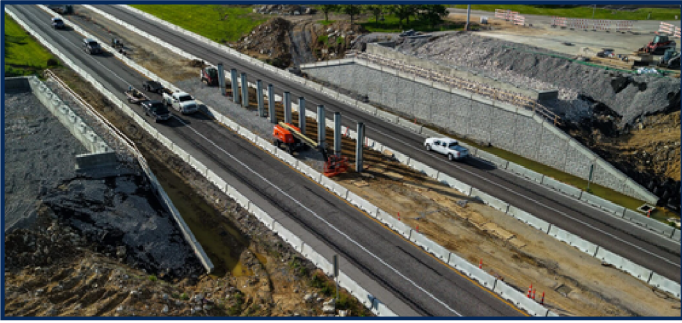
Progress continues on the new MO Route 47 bridge over I-70 in Warrenton.

Progress continues on the construction of the new MO Route 47 bridge over I-70 in Warrenton (mile marker 193). Crews recently completed the substructure work on the new bridge. Over the next couple of weeks, crews will be setting bridge girders at this location and will start the process of getting the future driving surface ready for concrete. The bridge is anticipated to be complete by this summer, however, work to complete the full interchange in the area will continue through Spring 2028.