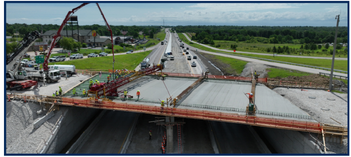
Crews poured the bridge deck of the St. Charles Road bridge over I-70 in Columbia.

In April 2026, crews with the Columbia to Kingdom City project demolished the St. Charles Road bridge over I-70 (mile marker 131) on the eastern side of Columbia. Over the course of just two months, crews have made significant progress on this replacement. In early June, the deck pour was completed for the driving surface. This work highlights another impressive milestone for the Improve I-70: Columbia to Kingdom City project. While great progress is being made, there is still a lot of work to complete before opening the bridge, which is on track to open earlier than the original anticipated September 2026 date, weather permitting.