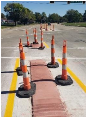
Hardened Centerline at Shackleford Rd and Old Halls Ferry Rd

Based on the Highway Safety Manual’s methodology, traffic calming is estimated to reduce crashes by one-third. In one study from the City of Chicago , hardened centerlines reduced all crashes by 24%.