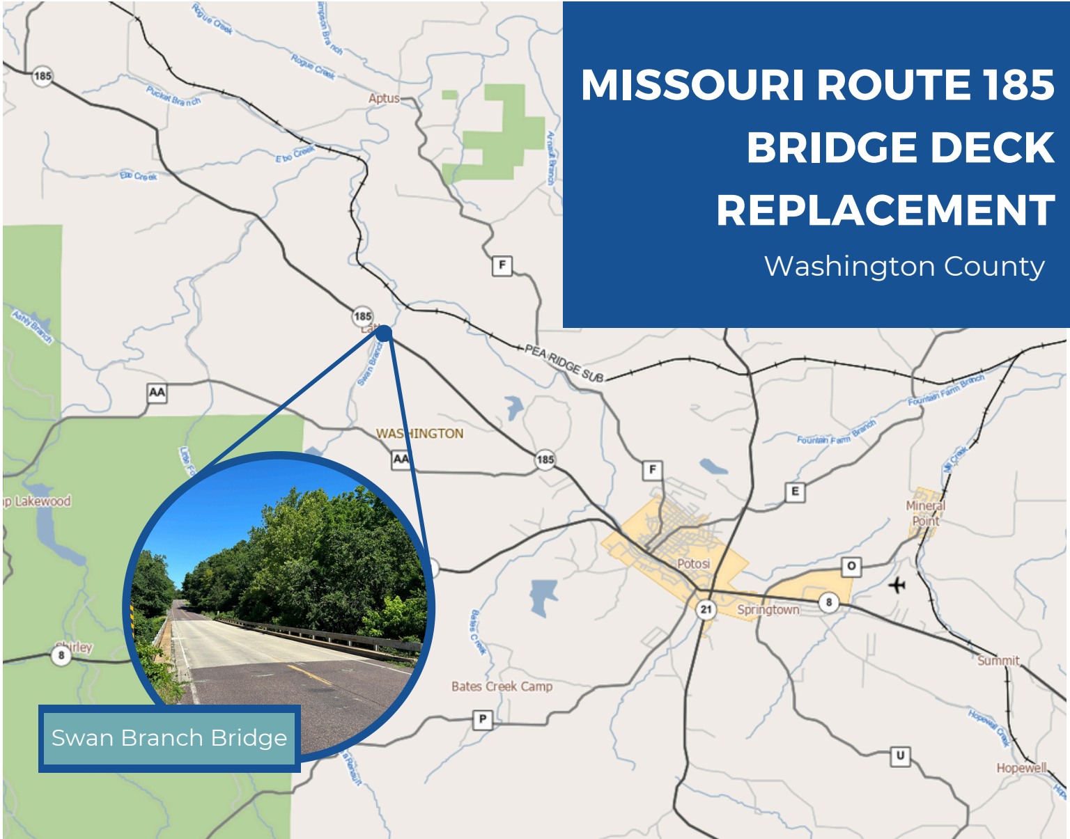
Swan Branch Bridge