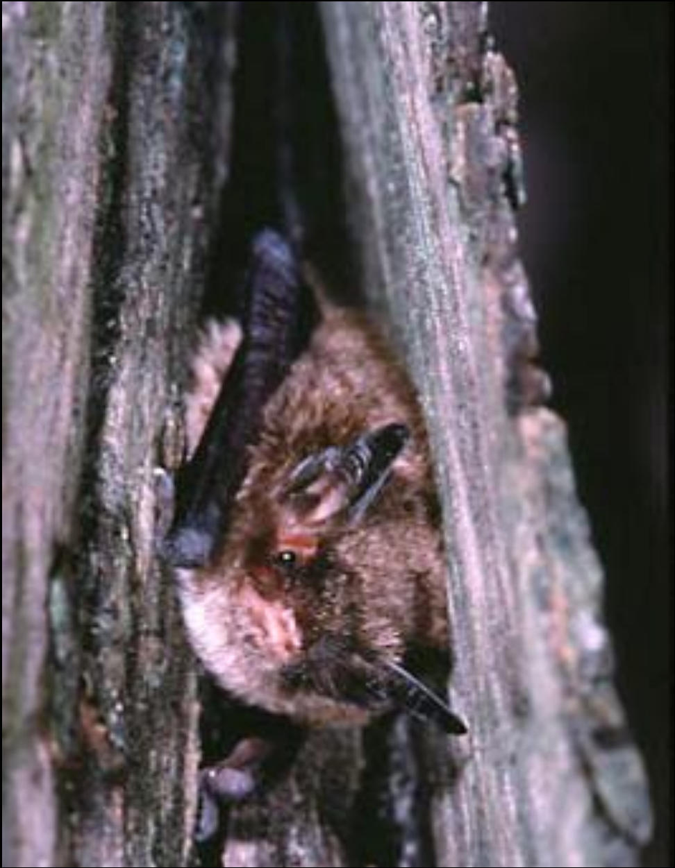
Endangered Indiana bat emerging from tree roost