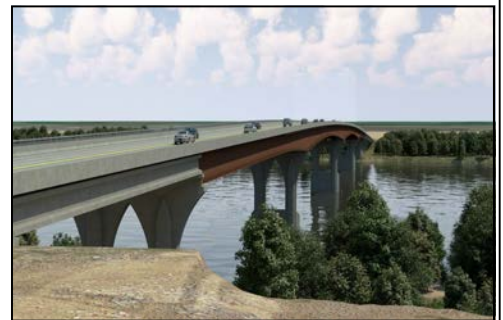
Rendering of the new bridge

The new bridge will be located just west of the existing bridge. It will have two, 12-foot lanes with ten-foot shoulders. It will also have a ten-foot bike/pedestrian path that will connect to the KATY Trail in Warren County. The estimated cost of the new bridge is $43 million.