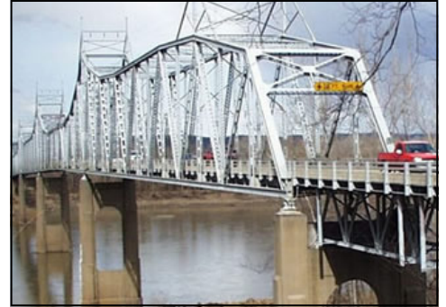
Current Route 47 Missouri River Bridge

The current Route 47 Missouri River Bridge needs to be replaced due to its deteriorating condition. The narrow bridge has no shoulders and a restricted weight limit. The bridge is a vital link for both Franklin and Warren Counties with about 11,000 vehicles a day using it.