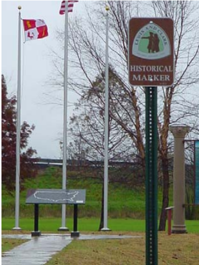
Lewis and Clark Historical Marker Signs Missouri Department of Transportation Charleston

Scenic or Historic Highway Programs Including Tourist and Welcome Centers: This category provides funding for the construction of turnouts, overlooks, visitor centers, viewing areas, and designation signs and markers.