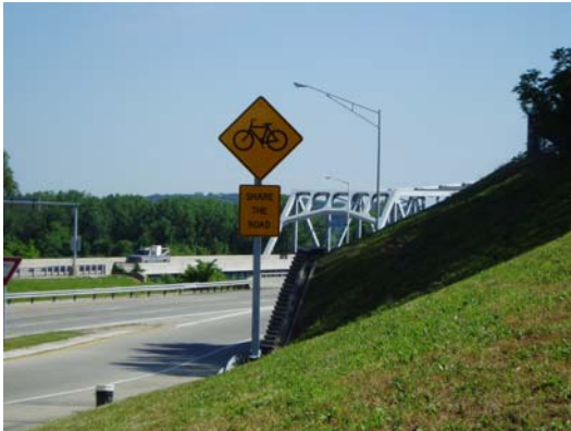
Missouri River Bridge Missouri Department of Transportation Jefferson City

Pedestrian and Bicycle Safety and Education Activities: These programs are designed to encourage walking and bicycling by providing education and safety instruction to potential users through classes, pamphlets and signage.