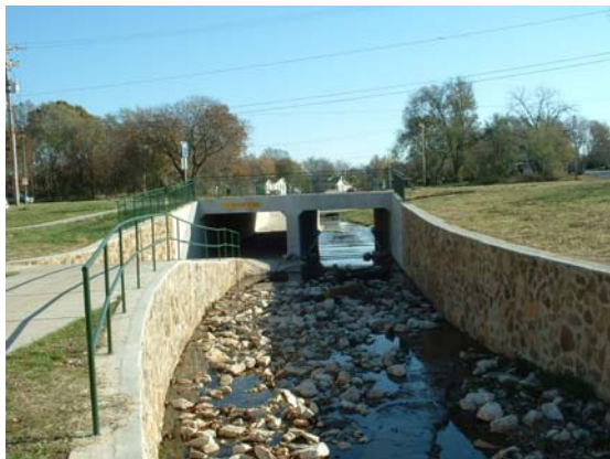
Upper Jordan Creek Greenway City of Springfield

Environmental Mitigation of Runoff Pollution and Provision of Wildlife Connectivity: This category provides funding for runoff pollution studies, soil erosion controls, detention and sediment basins, river clean-ups and wildlife crossings.