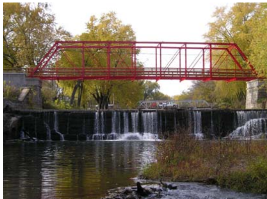
Restoration of the Old Appleton Bridge Village of Old Appleton

Facilities: This category supports the restoration of railroad depots, bus stations and lighthouses, and the rehabilitation of rail trestles, tunnels and bridges.