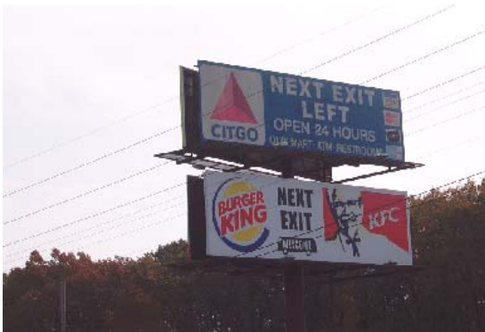
Billboard Baseline Inventory Missouri Department of Transportation Jefferson City

Control and Removal of Outdoor Advertising: This category provides funding for billboard inventories or removal of illegal and nonconforming billboards.