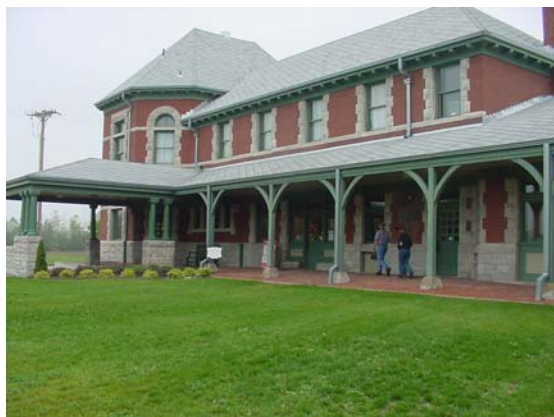
Sedalia Katy Depot / Railroad Heritage Museum City of Sedalia

Establishment of Transportation Museums: This category supports construction of transportation museums, including the conversion of railroad stations or historic properties to museums, with transportation themes and exhibits or the purchase of transportation-related artifacts.