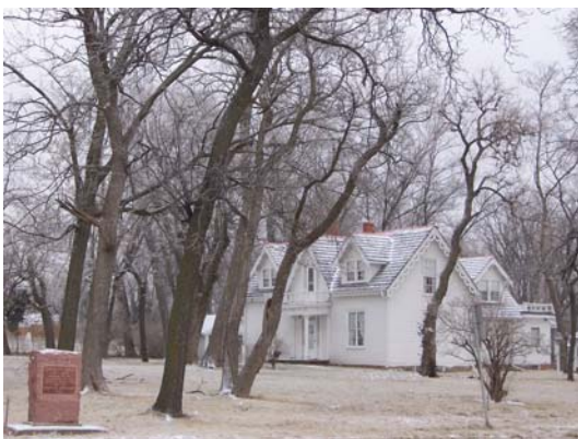
Acquisition of the Rice-Tremonti House City of Raytown

Acquisition of Scenic or Historic Easements and Sites: This category provides funding for acquiring scenic land easements, vistas and landscapes; acquiring historic battlefields; purchasing buildings in historic districts or historic properties; and preserving farmland.