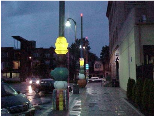
Delmar Community Pathway City of St. Louis

Landscaping and Scenic Beautification: This category provides funding for improvements such as street furniture, lighting and public art, and landscaping along streets, historic highways, trails, interstates, waterfronts and gateways.