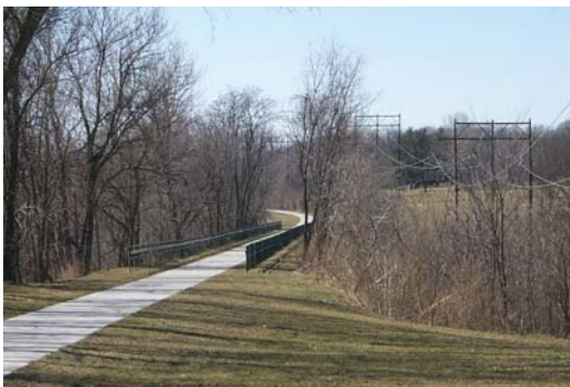
Urban Trail Corridor – Phase 7 City of St. Joseph

Conversion of Abandoned Railway Corridors to Trails: This category provides funding for acquiring railroad rights of way; planning, designing and constructing multi-use trails; and developing rail-with-trail projects.