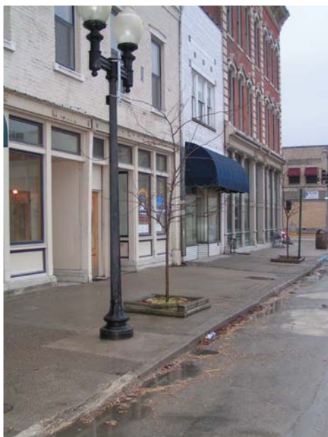
Hannibal Mark Twain Area Restoration Project City of Hannibal

Historic Preservation: This category provides funding for preservation of buildings and facades in historic districts, restoration and reuse of historic buildings for transportation-related purposes and pedestrian access improvements to historic sites and buildings.