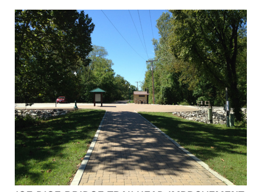
JOE DICE BRIDGE TRAILHEAD IMPROVEMENT Warsaw, Missouri

CFS provided engineering design and construction services for numerous bridges in Cass County, MO. A sampling of bridges include: Bridge No. 1120004, BRO-B019 (32) over Big Creek, Grand River Road Bridge Replacement Project, and Broadman Road Bridge Replacement, Br. No. 02200001, BRO-B019, Br. No. 3000006, BRO-B019, Br. No. 3290013, BRO-B019, Br. No. 2170001, Br. No. 51100101, and Br. No. 4520013 over Big Creek.