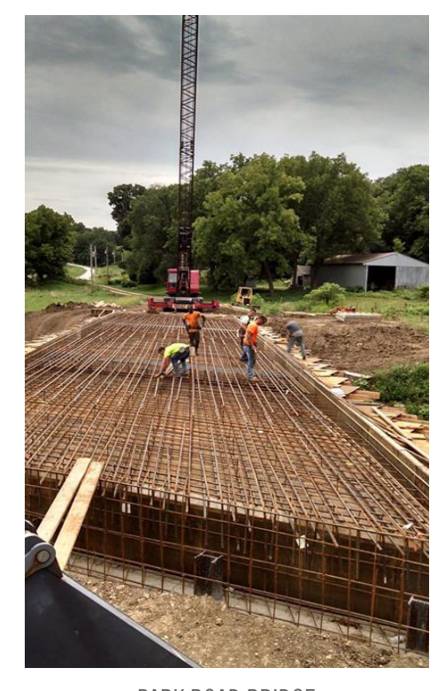
PARK ROAD BRIDGE Cass County, Missouri