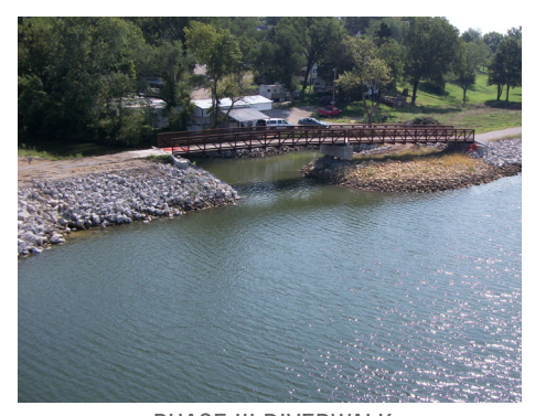
PHASE III RIVERWALK Warsaw, Missouri