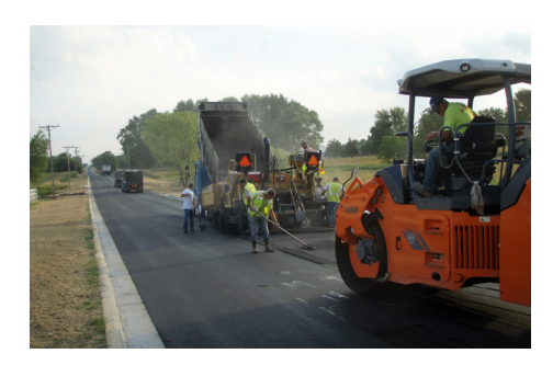
SCHOOL ROAD | PHASE II Cass County, Missouri