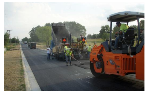
SCHOOL ROAD | PHASE II Cass County, Missouri