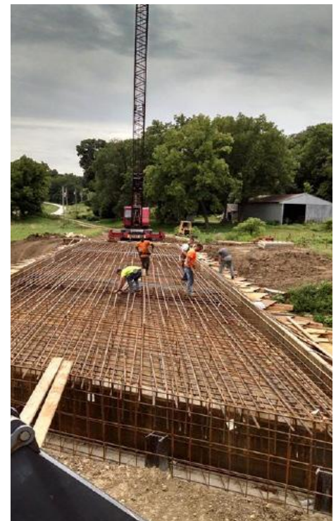
PARK ROAD BRIDGE Cass County, Missouri