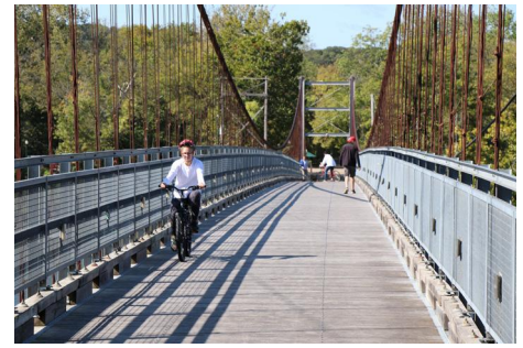
JOE DICE BRIDGE IMPROVEMENT Warsaw, Missouri

CFS provided engineering design and construction services for numerous bridges in Cass County, MO. A sampling of bridges include: Bridge No. 1120004, BRO-B019 (32) over Big Creek, Grand River Road Bridge Replacement Project, and Broadman Road Bridge Replacement, Br. No. 02200001, BRO-B019, Br. No. 3000006, BRO- B019, Br. No. 3290013, BRO-B019, Br. No. 2170001, Br. No. 51100101, and Br. No. 4520013 over Big Creek.