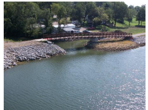
PHASE III RIVERWALK Warsaw, Missouri