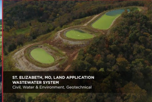
ST. ELIZABETH, MO, LAND APPLICATION WASTEWATER SYSTEM Civil, Water & Environment, Geotechnical