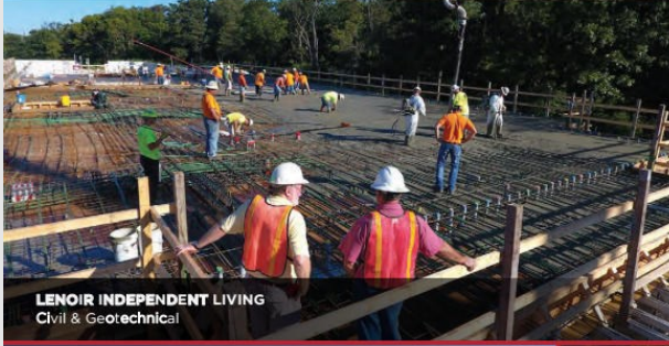
LENOIR INDEPENDENT LIVING Civil & Geotechnical