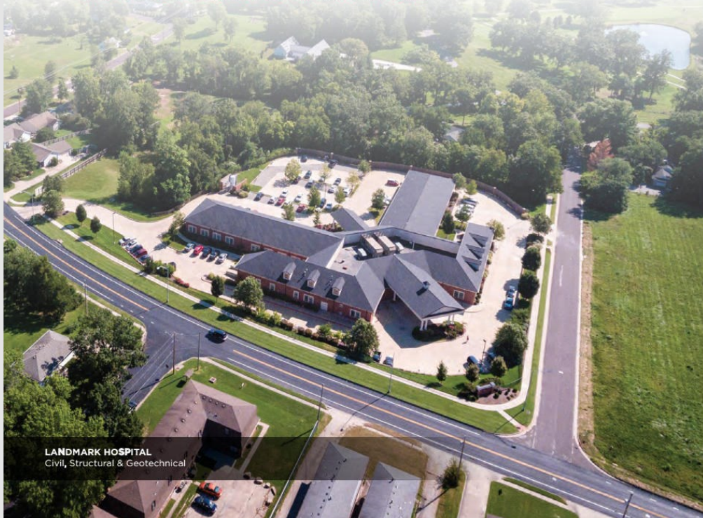
LANDMARK HOSPITAL Civil, Structural & Geotechnical

Allstate Consultants LLC (Allstate) is a full-service civil engineering consulting firm offering design solutions for public and private sector clients across the region. Headquartered in Columbia, Missouri, with offices in Marceline, MO, and Lee's Summit, MO, Allstate partners with clients to assist with all stages of project development, from funding acquisition to planning and design to construction inspection and post project support. Since 1975, Allstate's innovative, solution-based approach has been applied to a full range of projects.