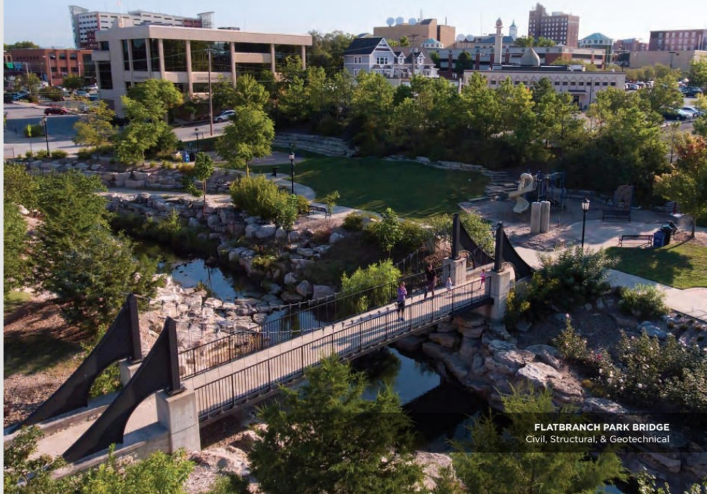
FLATBRANCH PARK BRIDGE Civil, Structural, & Geotechnical

Allstate Consultants LLC (Allstate) is a full-service civil engineering consulting firm offering design solutions for public and private sector clients across the region. Headquartered in Columbia, Missouri, with offices in Marceline, MO, and Lee's Summit, MO, Allstate partners with clients to assist with all stages of project development, from funding acquisition to planning and design to construction inspection and post project support. Since 1975, Allstate's innovative, solution-based approach has been applied to a full range of projects.