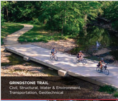
GRINDSTONE TRAIL Civil, Structural, Water & Environment, Transportation, Geotechnical