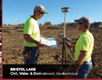
BRISTOL LAKE Civil, Water & Environment, Geotechnical