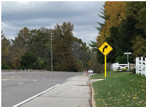
Curve Warning Sign

These improvements combined are estimated to reduce crashes on this segment of Clarkson Road by 97 crashes over five years .