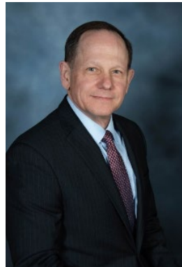
Francis Slay Appointed: 01/02/2024 Term Ending: 03/01/2027 Political Party: Democrat