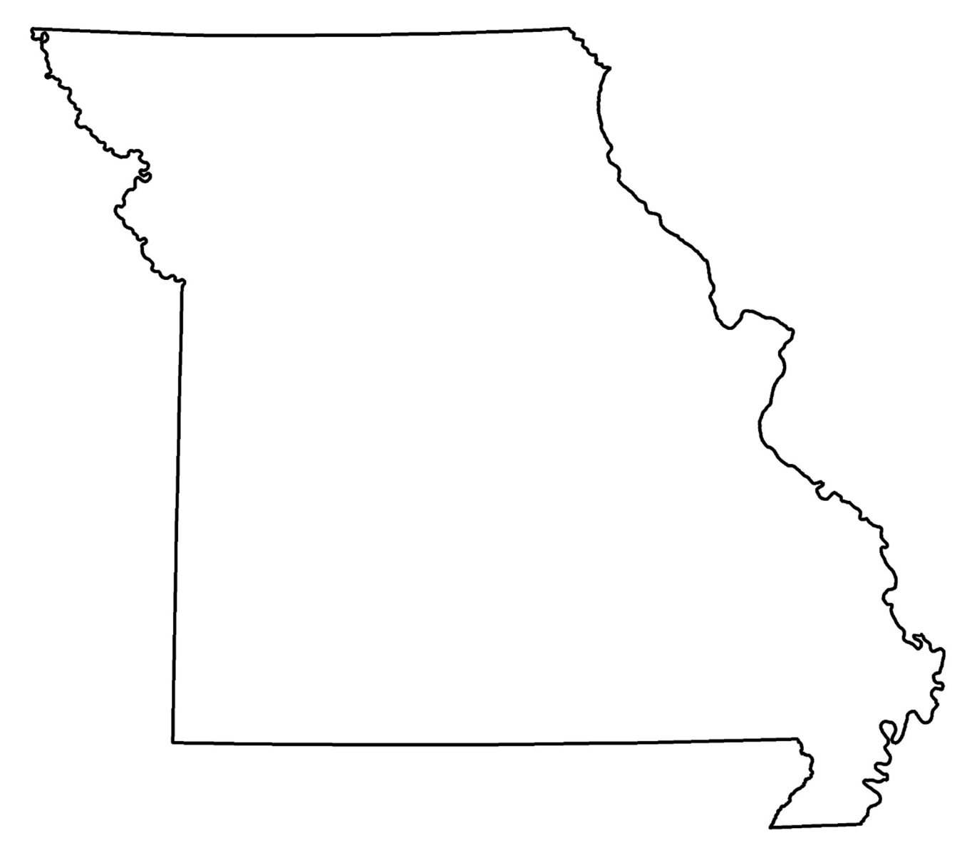
MoDOT's Statewide Projects