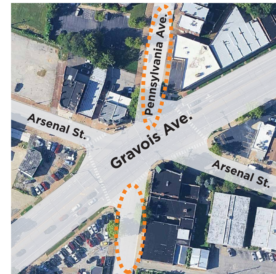
GRAVOIS & ARSENAL