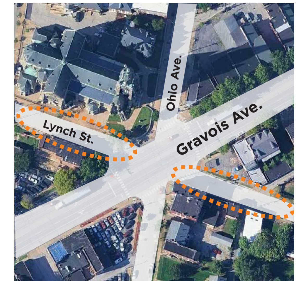
GRAVOIS & OHIO