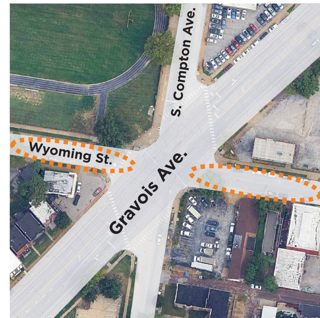
GRAVOIS & COMPTON