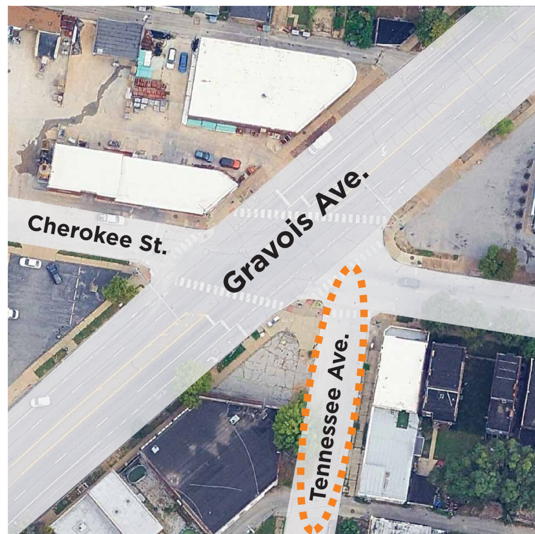
GRAVOIS & CHEROKEE