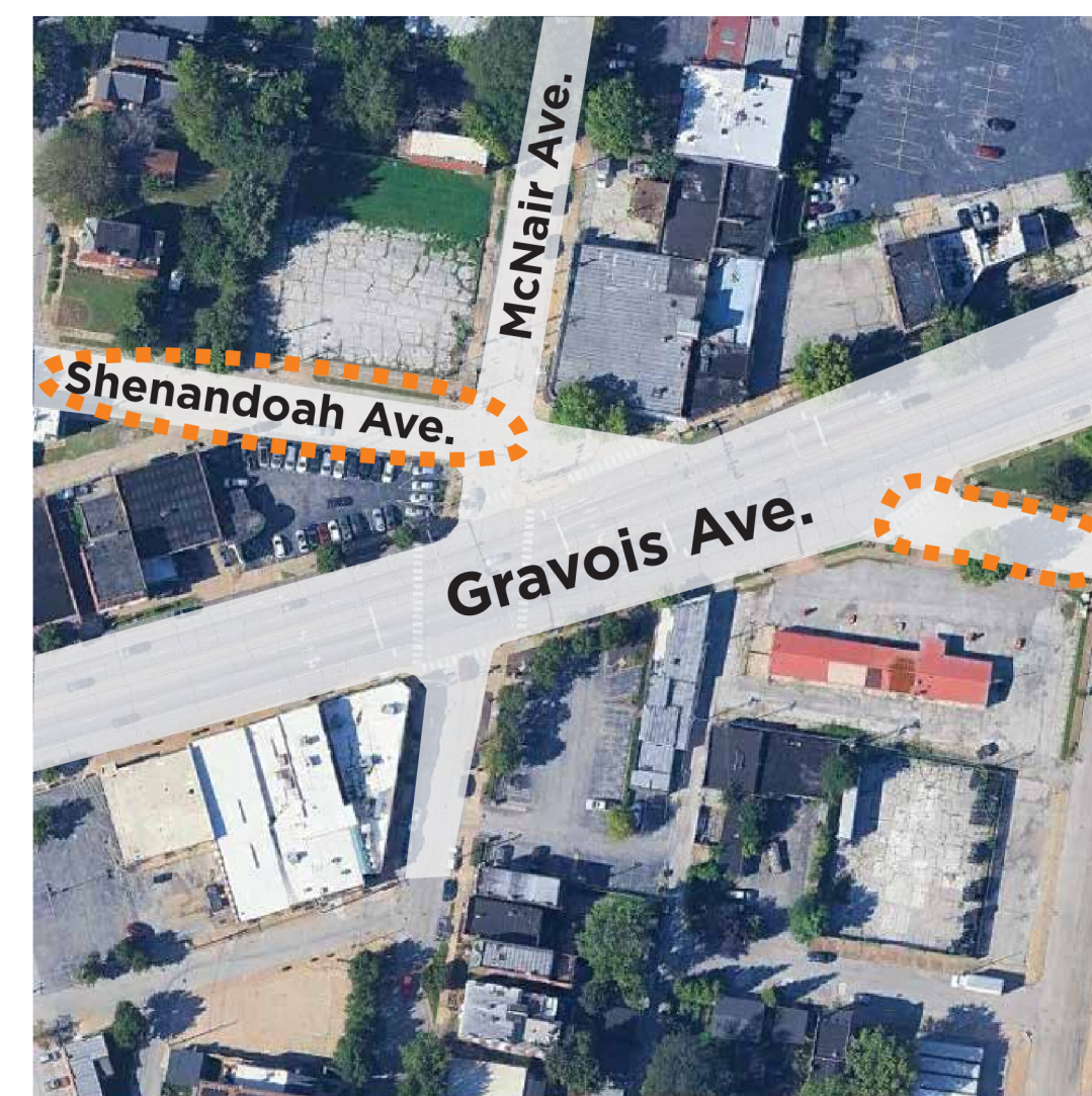
GRAVOIS & MCNAIR