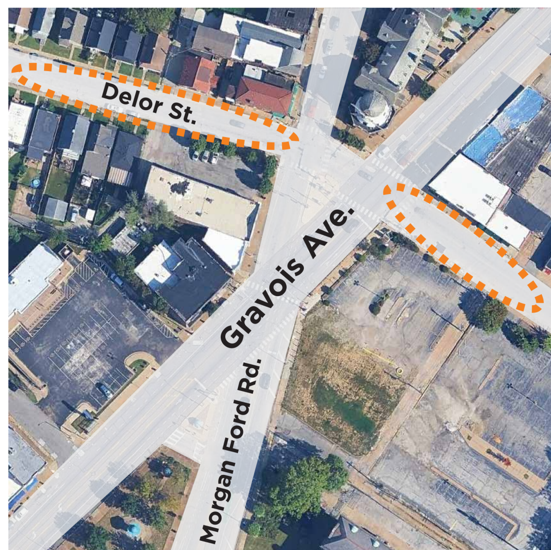
GRAVOIS & MORGAN FORD