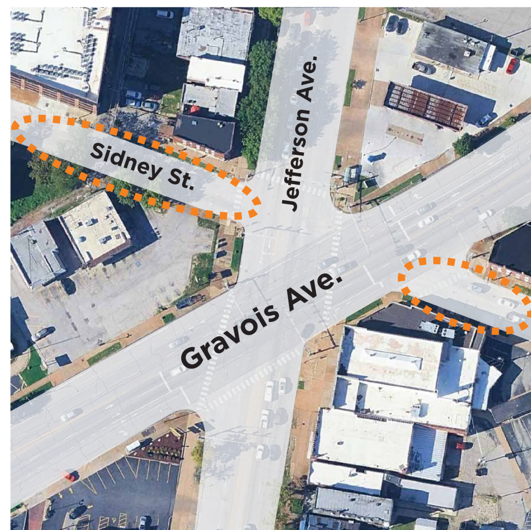
GRAVOIS & JEFFERSON