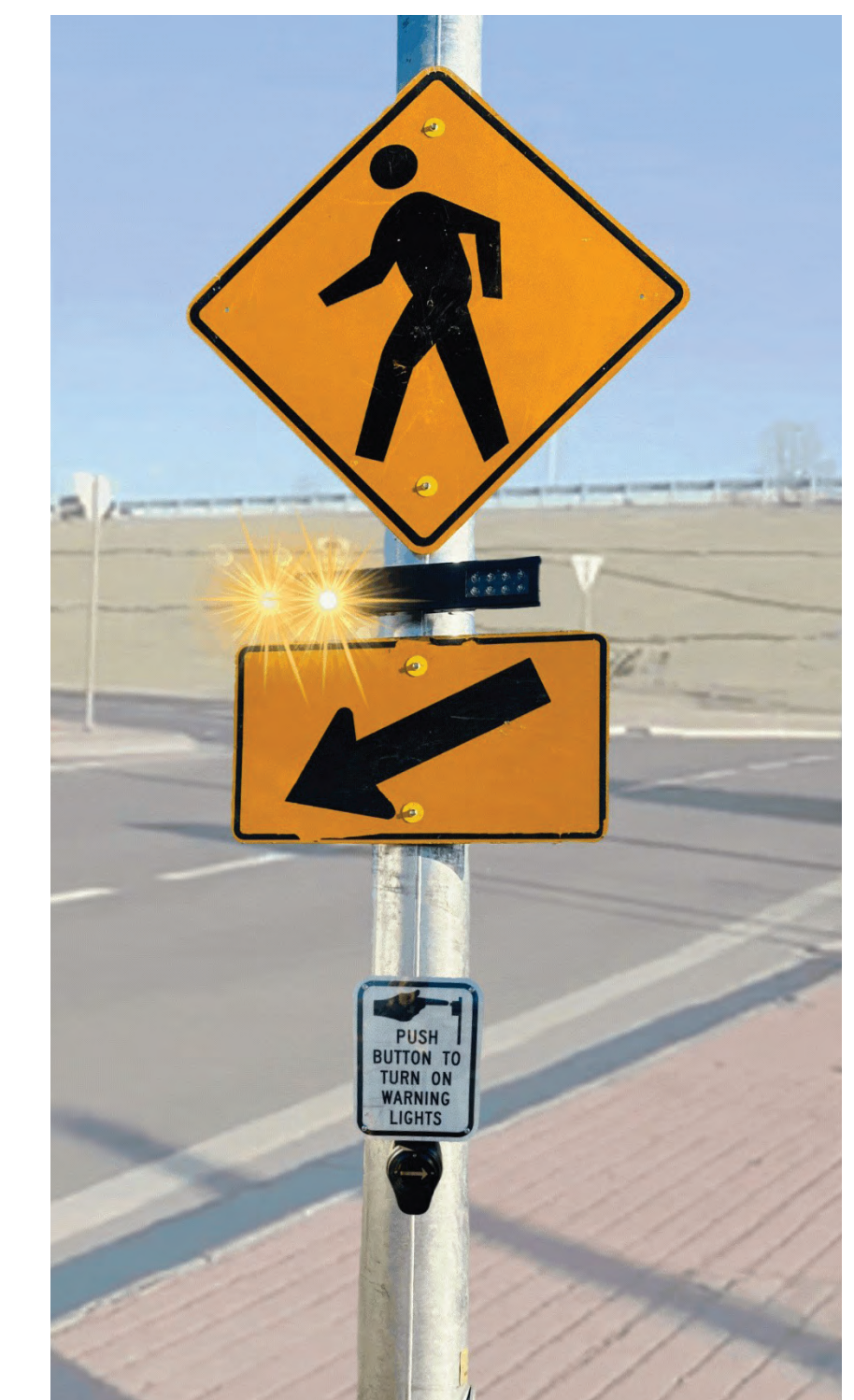
Example of RRFB