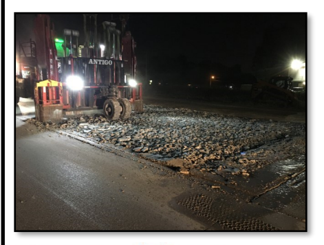
Missouri Department of Transportation 1-888 ASK MODOT (275-6636) www.modot.org/northeast