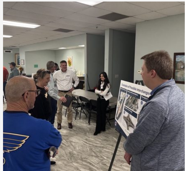
Community members engage in discussions and review project boards during the public meeting.

In addition, 80% of respondents agreed that addressing the top three identified needs for the interchange would result in a successful project: