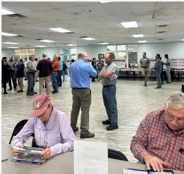
Community members complete the survey during the public meeting.

56% of respondents think Completing the Project On-Time is Very Important