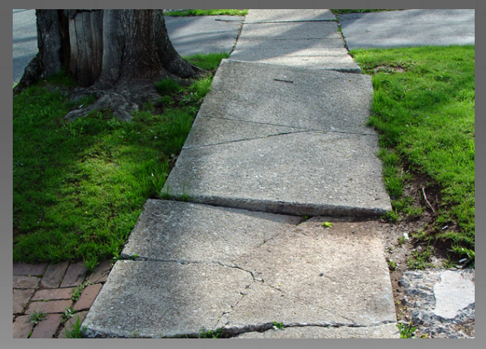
Challenge #2 – Agency Responsibility