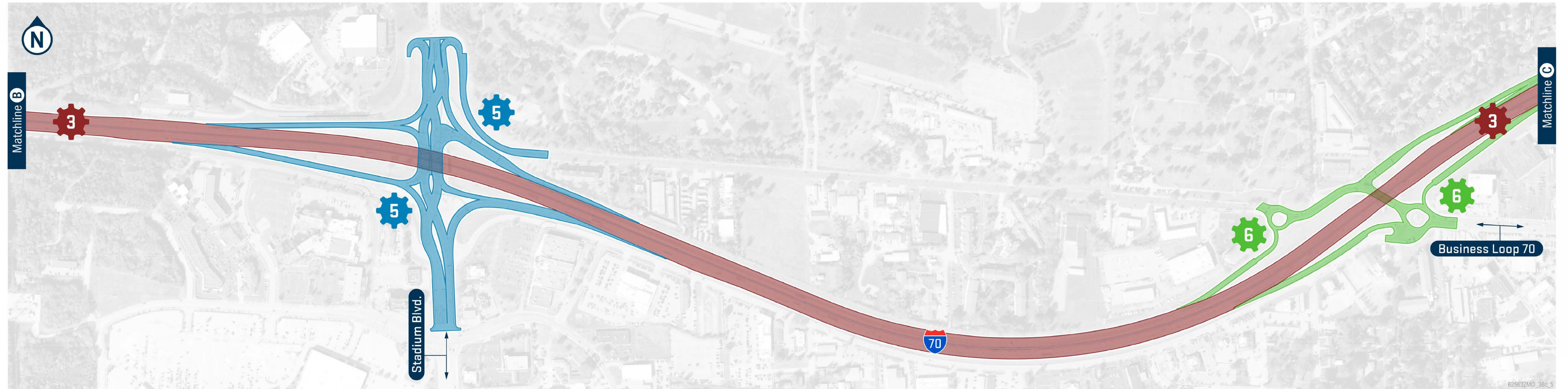
FIGURE: URBAN CONSTRUCTION PHASING