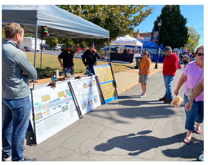
I-270 North Project team talk with public about the project at the Florissant Fall Festival.