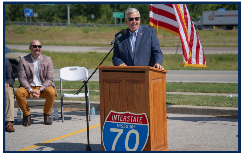
Governor Parson speaks to crowd about infrastructure at groundbreaking ceremony near I-70 and Route 63 interchange in Columbia.

"Today's groundbreaking is a momentous occasion not only because we're kicking off our historic Improve I-70 project, but it's a culmination of the bold infrastructure initiatives we've prioritized since day one," said Governor Parson.