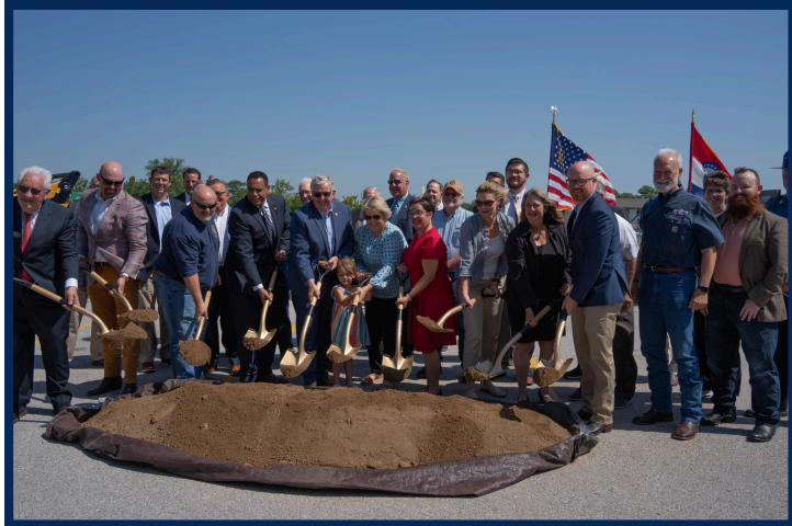
Governor Parson, alongside his family, and numerous elected officials and key leaders celebrated the groundbreaking of Improve I-70 Project #1: Columbia to Kingdom City on June 13.

The groundbreaking of the first project within MoDOT's Statewide Improve I-70 Program kicked off with an official ceremony on Thursday, June 13, in Columbia. Missouri Governor Mike Parson joined federal, state, and local elected officials along with members of the Missouri Highways and Transportation Commission and its Design-Build contractor team to break ground on Project #1: Columbia to Kingdom City .