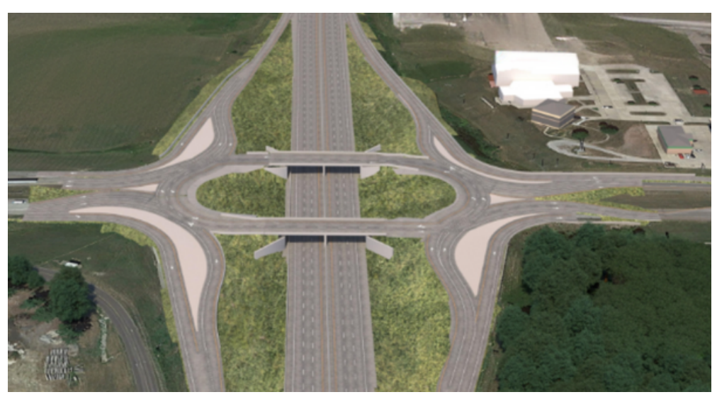
New I-70 and U.S. Route 54 Interchange

A roundabout is a one-way circular intersection that channels traffic around a central island without traffic signals. Roundabouts are a great alternative to a signalized intersection when a high volume of traffic needs to get through with the least amount of inconvenience.