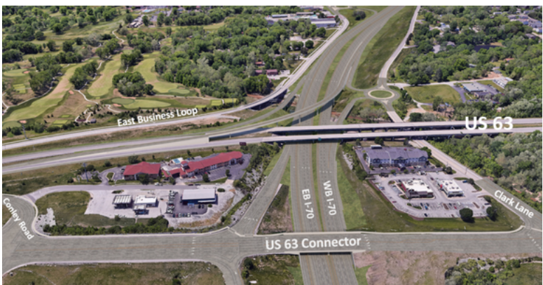
New I-70 and U.S. Route 63 Interchange

The I-70 and Route 63 interchange design includes two new direct connection ramps (northbound Route 63 to westbound I-70 and eastbound I-70 to southbound Route 63), four new roundabouts, two underpasses, and a collector-distributor road to facilitate the movement of traffic though and around the new interchange.